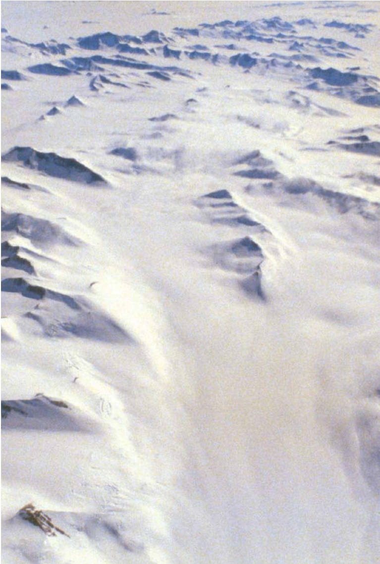
Sheets of ice cover Earth's South Pole.

Much of Earth's frozen water is at the North and South Poles.