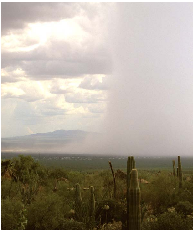
Clouds drop water on the desert as rain.

When invisible water in the air gets cold, it can make clouds. Clouds are tiny drops of liquid water. Those drops can get bigger. Then they fall as rain.