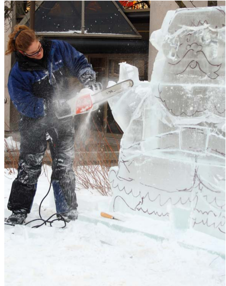
Ice can be carved into many shapes.

Most of the water we see is a liquid . Liquid water takes the shape of the container it is in.