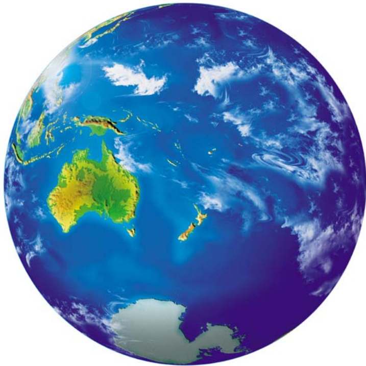
The dark parts in this picture of Earth are water.

Most of Earth is covered with water. Plants and animals need water to live.