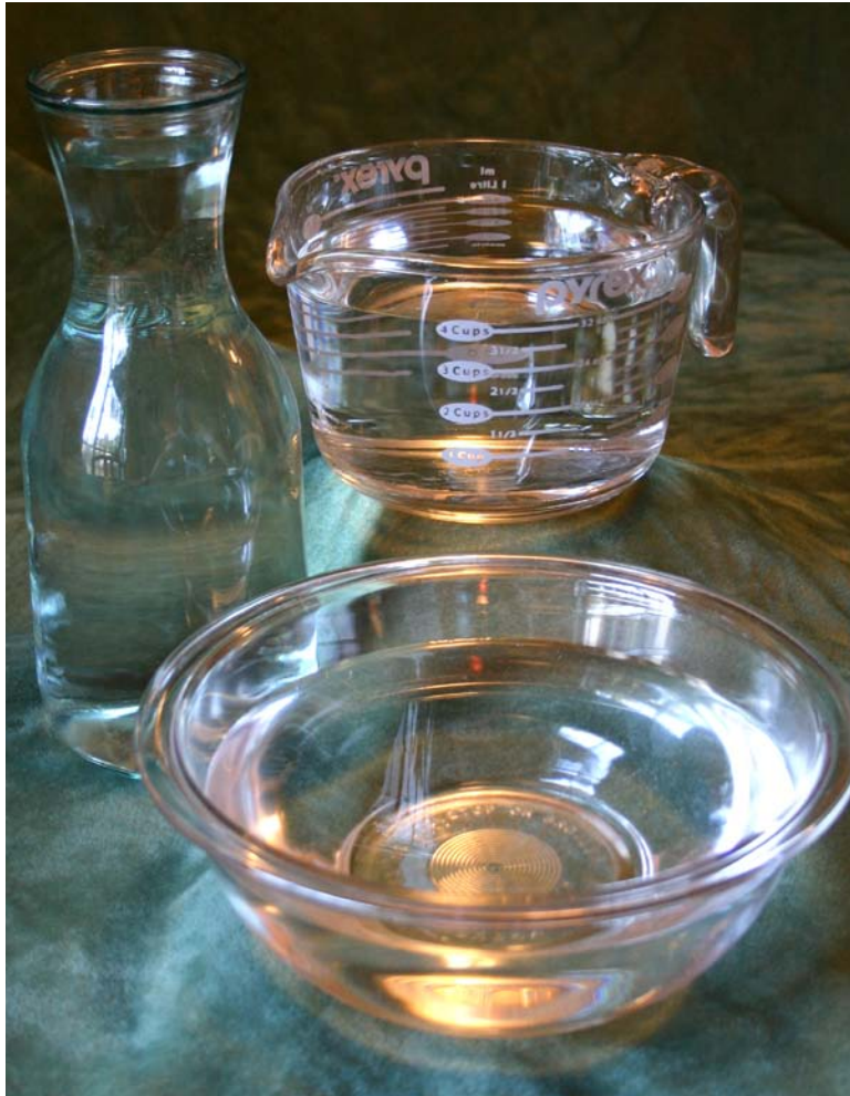
Each of these containers holds four cups of water.