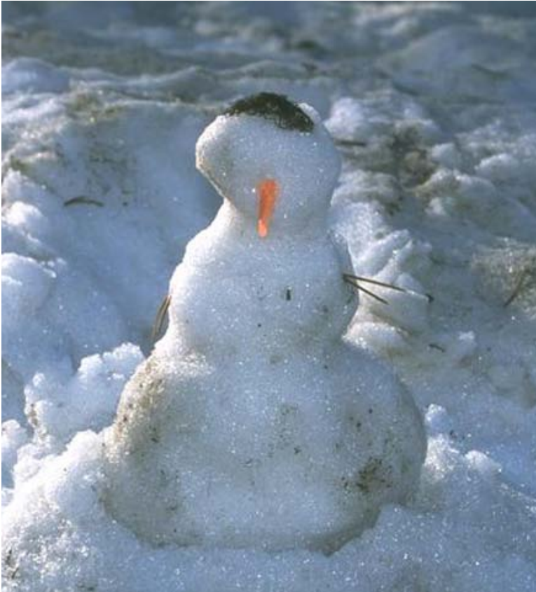
The sunlight heats up the snow, and the snowman melts.